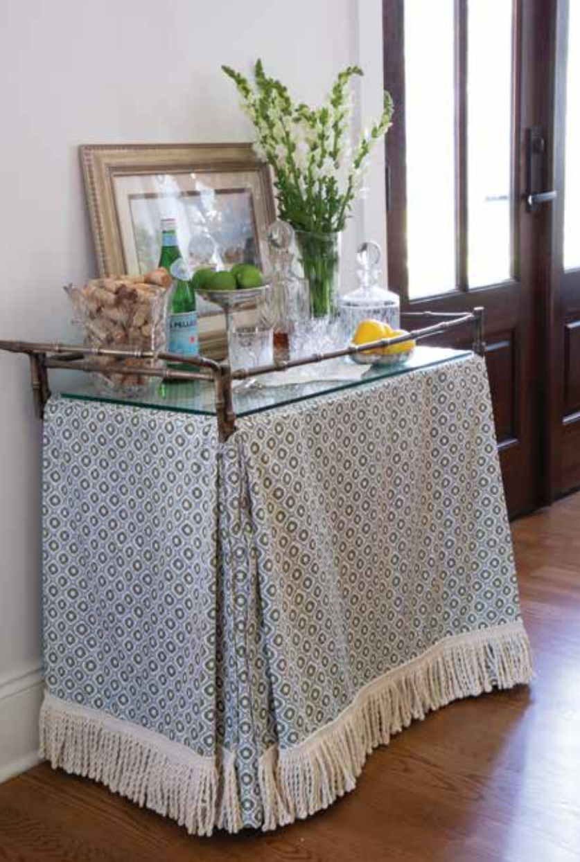
A fringed fabric was a creative answer to the Macklems' desire to tuck away less decorative elements like bottles in the bar cart. On the table, a mixed-and-matched setting of Herend dishes encapsulates the airy grace that fills the home.